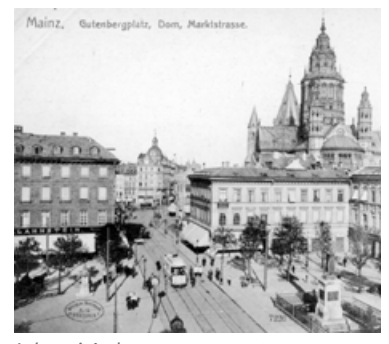
Lahnstein's department store at Gutenbergplatz (left)

boycott in 1933 was followed by various other campaigns, culminating in the disappearance of all Jewish-owned businesses from Mainz by 1939. The Jewish owners were forced to sell their businesses at extremely low prices.