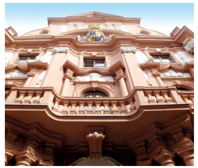
Dalberger Hof (1715 – 1718)

In 1945, Dalberger Hof was damaged so severely during air raids that the prison had to be closed. The prisoners were transferred to camps in the Mainz area. A commemorative plaque in the cellar of Dalberger Hof serves as a reminder of the building's function during the Nazi regime.