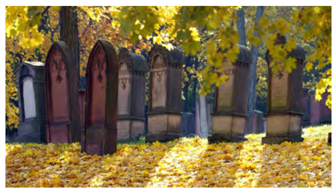
Old Jewish Cemetery ("Judensand")

In 1438, the Jews of Mainz were expelled by the city council at the instigation of the guilds, and the cemetery was cleared and ploughed up. The medieval tombstones were taken away and used as building materials in the centuries that followed. One section of the cemetery grounds was leased by the city for use as a vineyard.