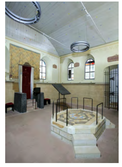
Restored synagogue in Weisenau

It was severely damaged during the siege of Mainz in 1793 – and the damage was only repaired 25 years later. Nazi rioters ransacked and desecrated the synagogue during the Kristallnacht pogrom of 1938. However, they did not set the building on fire for fear that the flames might spread to the neighbouring houses. In 1939, the synagogue and land were forcibly sold off and used as a barn and henhouse in the post-war period.