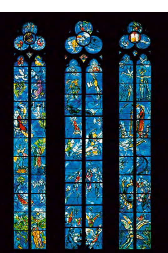
Chagall windows in the church choir

St. Stephan's Church is a Gothic building of cultural and historical importance, and it is also the only church in Germany to feature stained glass windows created by the Jewish artist Marc Chagall (1887–1985). Born in Belarus, he spent most of his life in France. As blue light falls through the windows into St. Stephan's Church, angels and figures from the Old Testament seem to float weightlessly in the room.