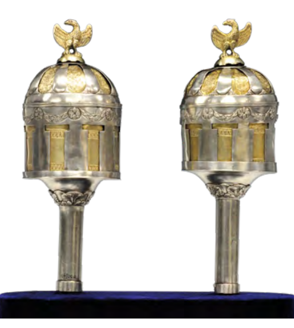
Torah crowns, Mainz State Museum

The corner pillars crowned with onion-shaped domes, the unusual jagged and horseshoe arches and the silver lantern serve as a reminder that Jewish culture flourished on the Iberian Peninsula in the Middle Ages under the rule of the Arab Moors. The mourning room was also intended to stand out from the neo-Romanesque and neo-Gothic style of Christian churches with its engineered iron construction, which features an artisanal façade covering. The mourning room was extensively renovated between 2004 and 2010.