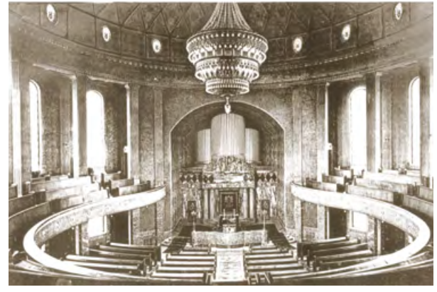
Prayer room in the former main synagogue

The architecture, with unique shapes and façades covered with green glazed ceramic profiles, marks a deliberate move away from standard building forms and materials. The impressive design rejects assimilation and harmonisation. Manuel Herz bridges the gap from the Middle Ages to the present day without referring directly to persecutions, pogroms or the Holocaust. His architectural work is based on texts handed down through the Torah. The fragments of the previous building's colonnade on the forecourt also form a connection between the destroyed main synagogue from 1912 and today's synagogue.