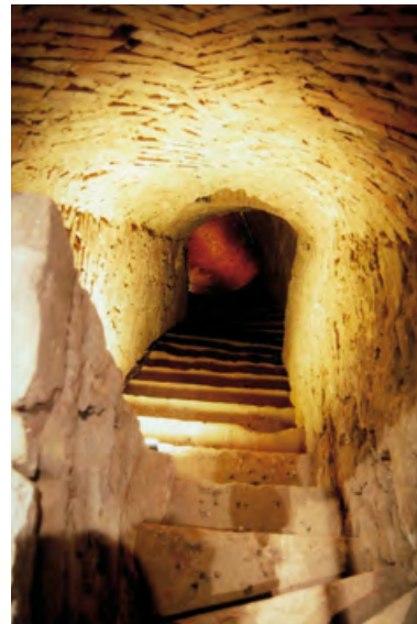
Steps leading to the mikveh

The synagogue sank into oblivion – it wasn't until 1978 that the building's original meaning was acknowledged by the "Jews in Mainz" exhibition. The building was listed as a historical monument, placed in the custody of the city of Mainz and restored with the help of the association founded in 1993. The synagogue was consecrated on 27 May 1996 – exactly 900 years after "Gezerot Tatnu", the day on which the Jewish community of Mainz was massacred by crusaders in 1096.