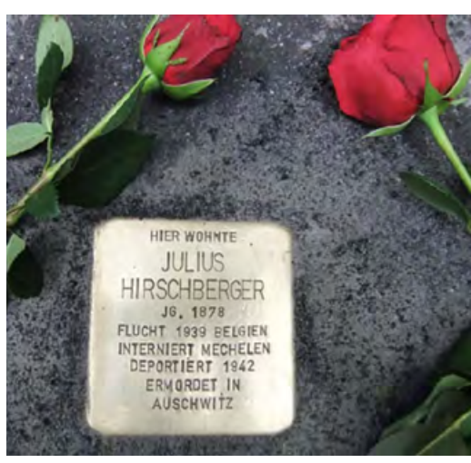
One of the Stolperstein memorials laid in Mainz

The small memorial plaques are embedded in the ground in front of the place where each victim last chose to live. Every person – every fate – is given their own individual Stolperstein. All the plaques are made by hand and usually begin with the words "Here lived..." followed by the name of the victim, their date of birth and their fate.