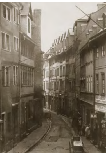
Judenviertel Hintere Synagogengasse

Due to the growth of the community and the way in which the houses were built, the residents had to endure extremely claustrophobic living conditions. To overcome the spatial restrictions, the properties in the Jewish Quarter were interlaced, narrow and entrenched.