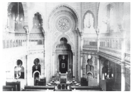
Orthodox synagogue built by Eduard Kreyßig

From 1846 to 1853, a synagogue with a mixture of Moorish and Romanesque stylistic elements was built for the liberal Israelite religious community between Klarastraße and what was then Rechengasse according to plans drafted by Ignaz Opfermann. It offered space for more than 760 people – until the new main synagogue was built in 1912. After being sold, it served as a warehouse for the city administration until 1937. It was ultimately destroyed during an air raid in 1945. The building is commemorated by a glass relief.