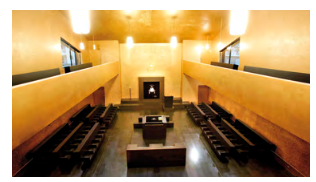
Prayer room in the new synagogue

The architecture, with unique shapes and façades covered with green glazed ceramic profiles, marks a deliberate move away from standard building forms and materials. The impressive design rejects assimilation and harmonisation. Manuel Herz bridges the gap from the Middle Ages to the present day without referring directly to persecutions, pogroms or the Holocaust. His architectural work is based on texts handed down through the Torah. The fragments of the previous building's colonnade on the forecourt also form a connection between the destroyed main synagogue from 1912 and today's synagogue.