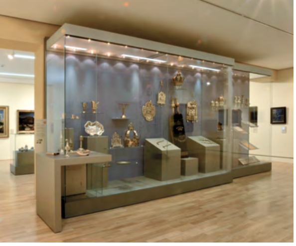
Mainz State Museum, Judaica Collection

Mainz State Museum Große Bleiche 49 - 51, D-55116 Mainz, Tel.: +49 6131 629637 www.landesmuseum-mainz.de