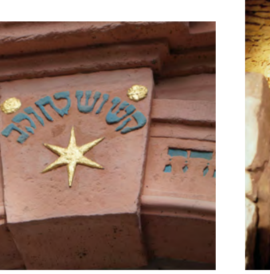
Synagogue entrance portal in Weisenau