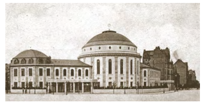
Main synagogue, destroyed in 1938

The main synagogue, which was built at the intersection of Hindenburgstraße and Josefsstraße in 1912 according to plans drafted by Stuttgart-based architect Willy Graf, was ransacked and set on fire during the Kristallnacht pogrom of 9 and 10 November 1938. The complex was built around a monumental rotunda with a large dome, where the actual prayer room was located. The rotunda was flanked by two lower side wings that housed a synagogue for weekday services, community areas, a wedding hall and the Museum of Jewish Antiquities. A colonnade was placed in front of each of the side wings. A customs office was built on the premises after the war. However, remains of the colonnade were found during building work in 1988 and have since been reconstructed. 98 years after the main synagogue had been consecrated in Mainz on 3 September 1912 and around 70 years after it had been destroyed by the Nazis, the first signs of vibrant Jewish life and culture began to re-emerge in the state capital of Rhineland-Palatinate. The new community centre, designed by Colognebased architect Manuel Herz, was inaugurated at the same location in 2010. "Kedushah" is the Hebrew word for "holiness" and is used to sanctify God's name; the five Hebrew letters give the new synagogue in Mainz its shape and structure.